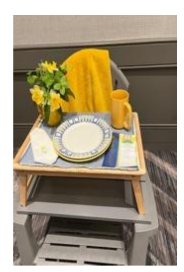
Congratulations to all the winners and to the Redbud District Flower Show members who worked to make this flower show a truly remarkable one!