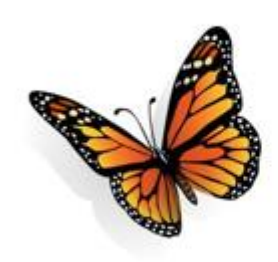
Rosalynn Carter Butterfly Trail ® 2023 Symposium & Native Plant Sale