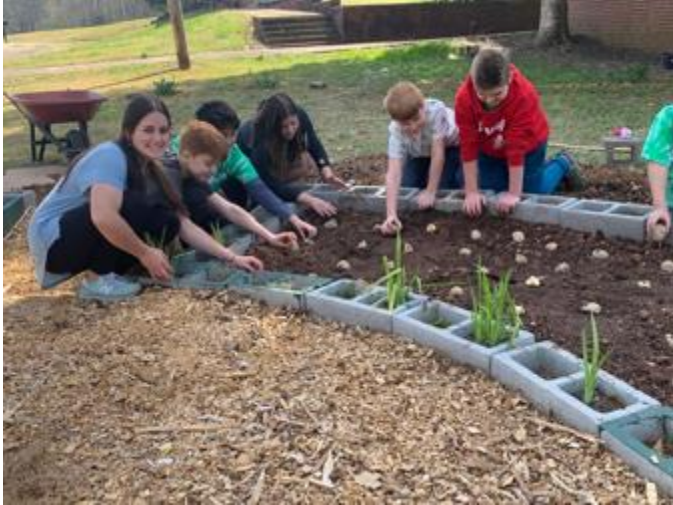
4-H members were a tremendous help to the "Heart and Soil" garden in Hogansville, March 29th, when they placed soil, mulch, and planted potatoes - our first crop of the season!